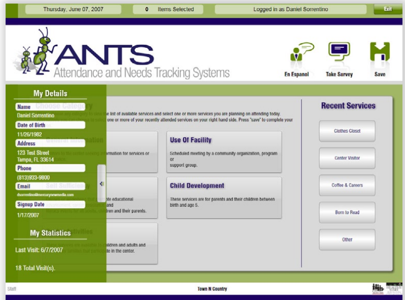
An easy-to-use control panel verifies registration information and records user demographics.