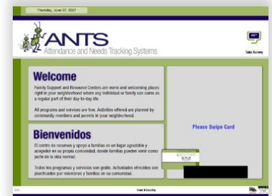
A welcome screen clearly explains kiosk use.