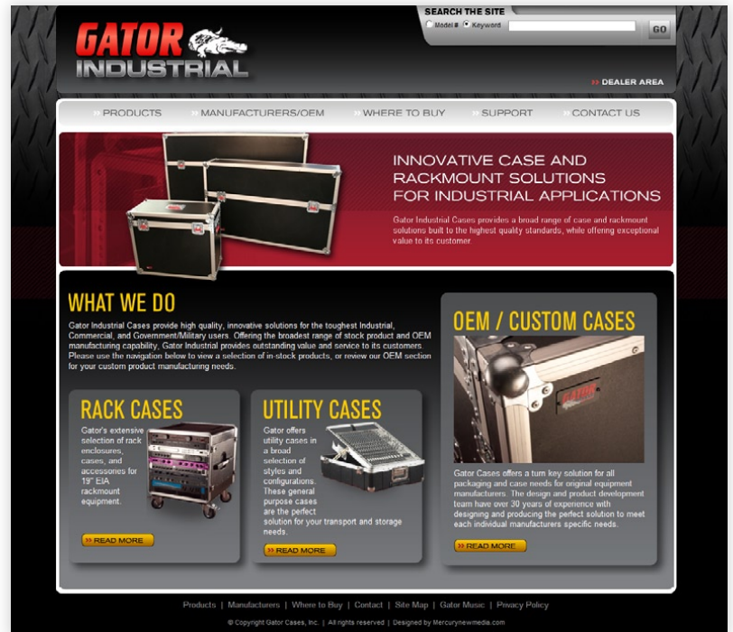
The home page offers preliminary product information and visually appealing photographs.