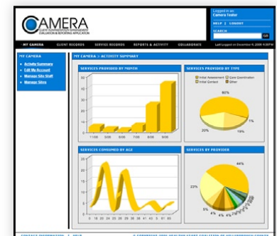
Real-time data reporting provides views of system data from several viewpoints.