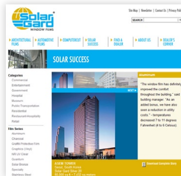
The Installations section presents product installations from around the world.