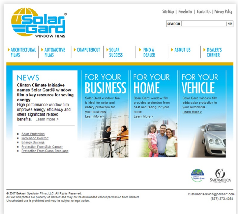
The Solar Gard branded home page presents current news and focused examples of product benefits.